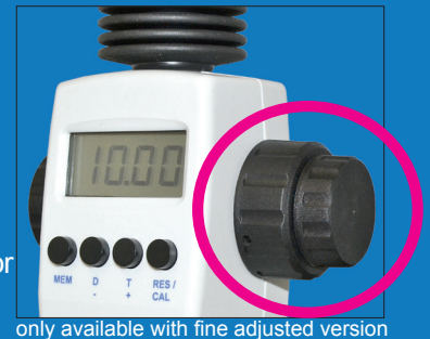
only available with fine adjusted version

Fine adjustment - with an additional knob the desired amount can be easily titrated or dispensed more precisely